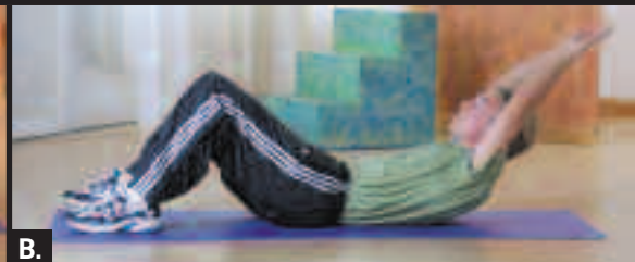
B. Long Arm Crunch