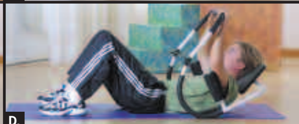
D. Ab Roller