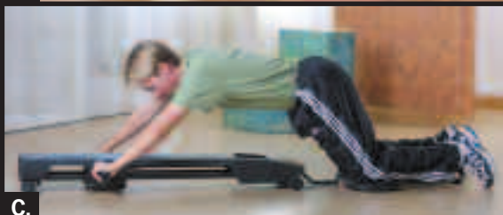
C. Torso Track